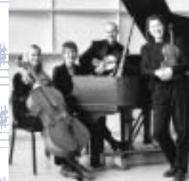
Icicle Creek Piano Quartet