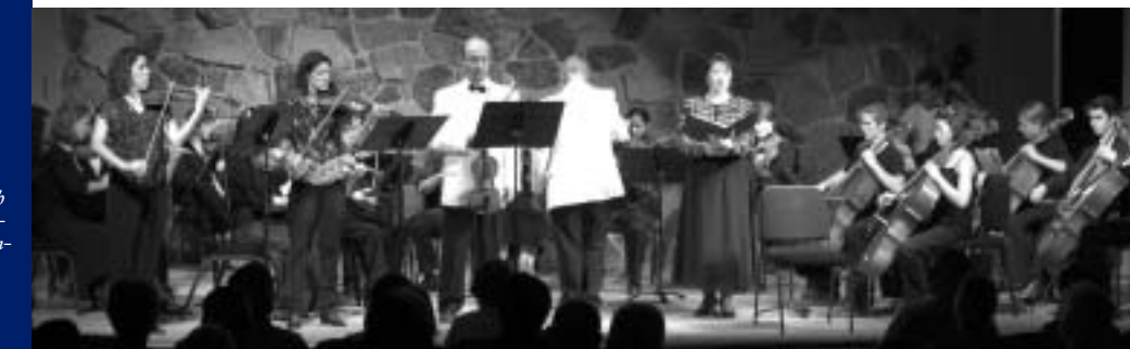
Icicle Creek Music Center is an independent, non-profit organization not affiliated with any commercial enterprise. ICMC is a membership organization, supported by contributors, sponsorships and donations from individuals and organizations and does not discriminate on the basis of race, color, national or ethnic origin.