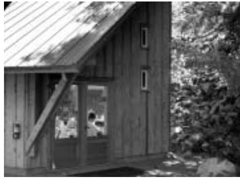
One of three small practice rooms on campus

Since summer our campus has hosted high school choir retreats and a workshop for professional musicians in late October. Voice and woodwind lessons with private teachers as well as strings and piano lessons with the members of the Piano Quartet are taking place all around the facility. Canyon Wren Recital