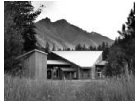
Canyon Wren Recital Hall

The second concert in the series will be on November 16, and will bring Early Music to Canyon Wren for the first time. The concert by Symphonie Nouvelle will feature the music of the courts and chapels of 17th and 18th century France, Germany and Italy. The ensemble Symphonie Nouvelle