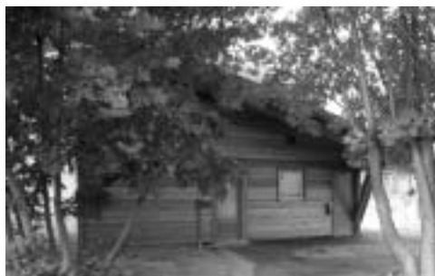
One of the new on-site cabins.

On June 23rd at 9:00 a.m. Icicle Creek Summer Symphony day camp opened for the first time on our new Icicle Creek campus. The practice cabins, lodging cabins and paths were completed just in the nick of time for that Monday morning, as 15 faculty and coaches joined the Icicle Creek Quartet members and staff to welcome 120 students to the first music camp on our Leavenworth campus. By the end of the first day students ages 7 to 17 and faculty were feeling right at home on our beautiful campus and looking forward to the rest of the week with excitement.