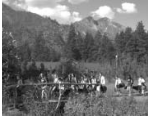
Summer Symphony students arrive on the ICMC campus.

On June 23rd at 9:00 a.m. Icicle Creek Summer Symphony day camp opened for the first time on our new Icicle Creek campus. The practice cabins, lodging cabins and paths were completed just in the nick of time for that Monday morning, as 15 faculty and coaches joined the Icicle Creek Quartet members and staff to welcome 120 students to the first music camp on our Leavenworth campus. By the end of the first day students ages 7 to 17 and faculty were feeling right at home on our beautiful campus and looking forward to the rest of the week with excitement.