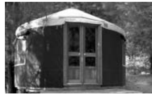
The student lounge Yurt was a hit!

The annual Summer Chamber Music Institute expanded for the first time from two weeks to three weeks thanks to the availability of our new facilities and to compliment the Festival schedule. Students and faculty were housed in our cabins. Almost around-the-clock there was "music in the air" on our campus with students taking full advantage of our practice buildings and Canyon Wren and its attached ensemble