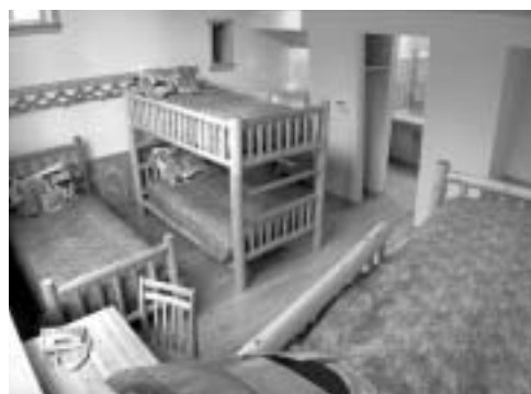
Interior of one of eight lodging cabins, two of which include a kitchenette.

If you or your organization is interested in talking with us about renting any or all of our campus please contact Vicki White for information and rates. Our facility includes 8 lodging cabins, two of which include a kitchenette, each sleeping 4 -5 persons, 3 small practice cabins, 3 larger ensemble rehearsal rooms, and the Canyon Wren Recital Hall. If more lodging is needed or meals are desired, groups are referred to Sleeping Lady Mountain Retreat.